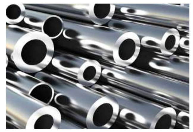
India's crude steel output falls over four percent to 8.48 million tonnes in August: World Steel

India's crude steel production fell over 4 per cent to 8.478 million tonnes (MT) in August 2020, according to the World Steel Association (worldsteel). The country had produced 8.869 MT of crude steel during the same month last year, the global industry body said in its latest report. However, global steel output has started showing a positive trend, the data showed. "World crude steel production for 64 countries reporting to the worldsteel was 156.244 MT in August 2020, registering a rise of 0.6 per cent compared to August 2019," the worldsteel said.